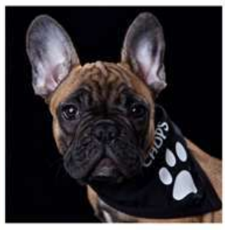
Don't put off getting your Paw-trait session and call me today!

My session fee is £75 but I will waiver it for the first 5 bookings hudus