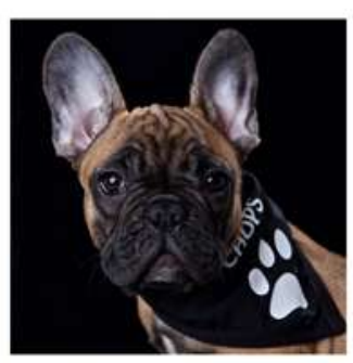
Don't put off getting your Paw-trait session and call me today!

My session fee is £75 but I will waiver it for the first 5 bookings Mount